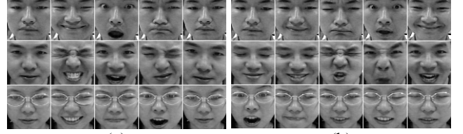
Figure 3. Sample images of (a) the training set, and (b) the testing set of the face database for performance evaluation.

randomly added to the left or the right side since three bits are required to specify the index of each segment as shown in the last row. Therefore, the index for the authentic region for this feature is 101 in this case.